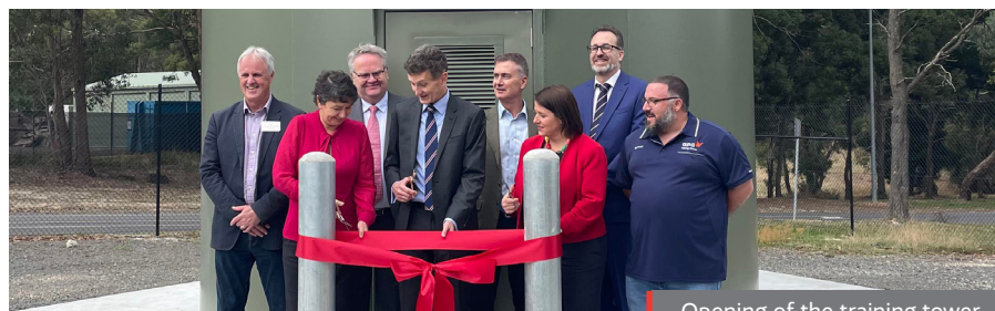
Opening of the training tower