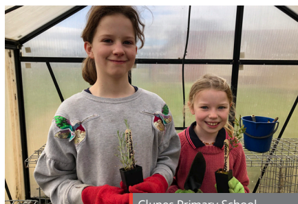
Clunes Primary School

Students received a bush tucker sampling and talk by the Murnong Mamas, an Indigenous Catering and Bush Food Group. The program will continue throughout the year.