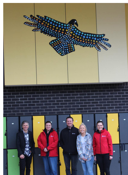
First Nations artwork at Beaufort Secondary College