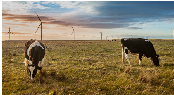
Mt Gellibrand Wind Farm