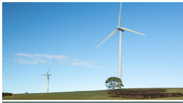
Gunning Wind Farm