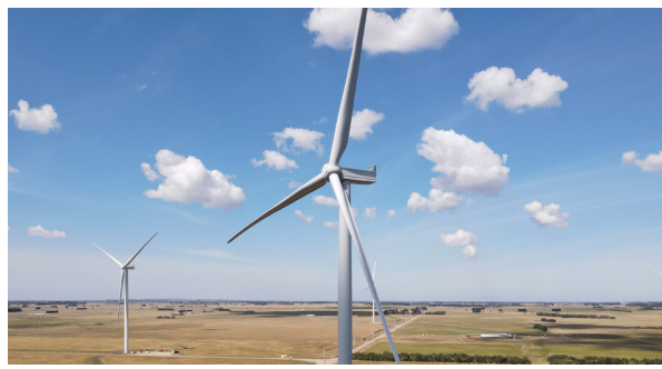
Mortlake South Wind Farm