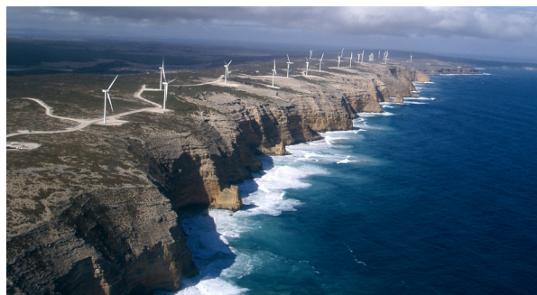
Cathedral Rocks Wind Farm