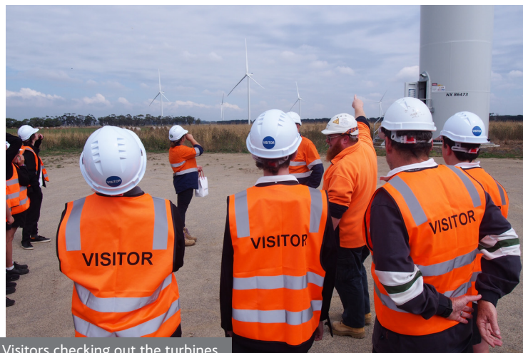
Visitors checking out the turbines

And they were even more thrilled when they found out about the scholarships and community programs that ACCIONA Energía offers.