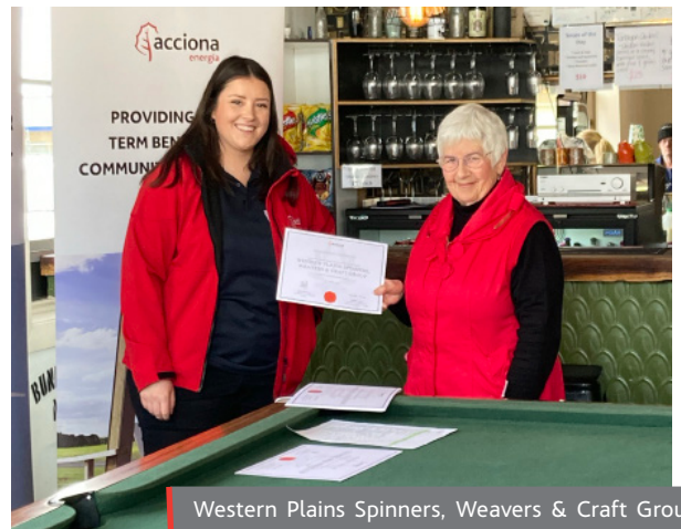
Western Plains Spinners, Weavers & Craft Group accepting their certificate at Mac's Hotel

This year's funding included almost $14,000 for local schools as well as support for local healthcare, sports, arts, and First Nations community groups. We are honoured to continue to fund these great initiatives and look forward to future sponsorship opportunities.