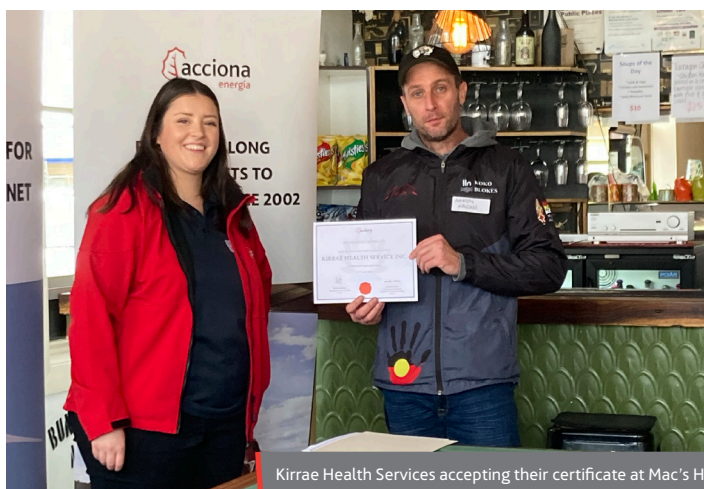
Kirrae Health Services accepting their certificate at Mac's Hotel