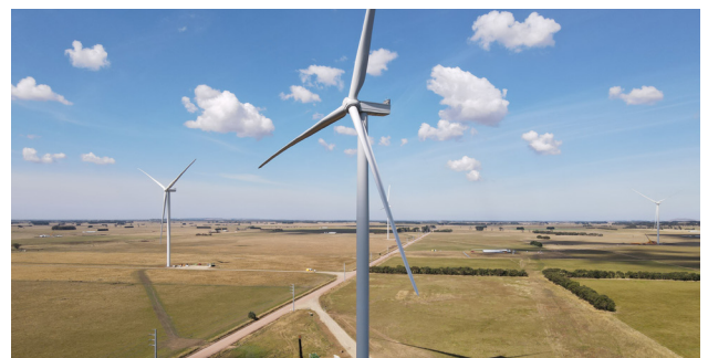
Mortlake South Wind Farm