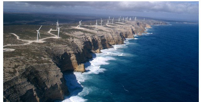
Cathedral Rocks Wind Farm