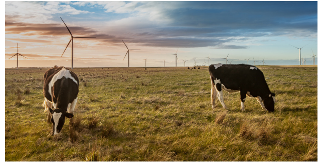
Mt Gellibrand Wind Farm