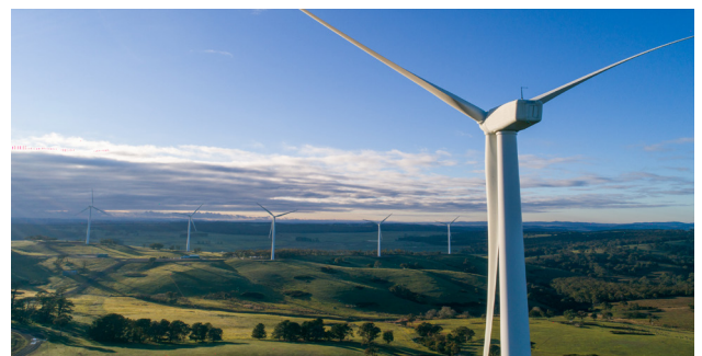
MacIntyre Wind Farm (construction commencement 2022)