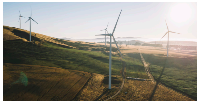
Waubra Wind Farm